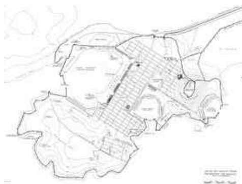
Fig. 1. Plan of the ancient city of Piraeus (Papachatzis 1974, 100-101)