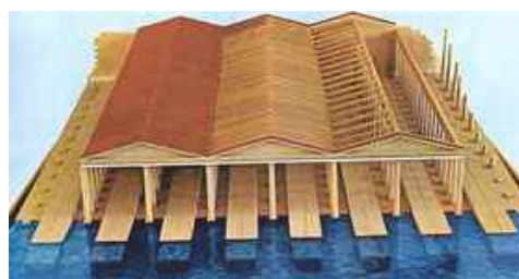
Fig. 3. Representation of ship-sheds of Zea at Piraeus Nautical Museum (Papachatzis 1974, 107)