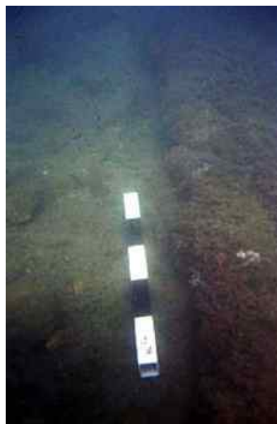
Fig. 7. Submerged rock foundation trench for the colonnade dividing shipsheds of the east side of Zea basin ( http://www.zeaharbourproject.dk/4/4_01_01_05.htm )

the eastern side of Zea basin ( http://www.zeaharbourproject.dk/4/4_01_01_03.htm )