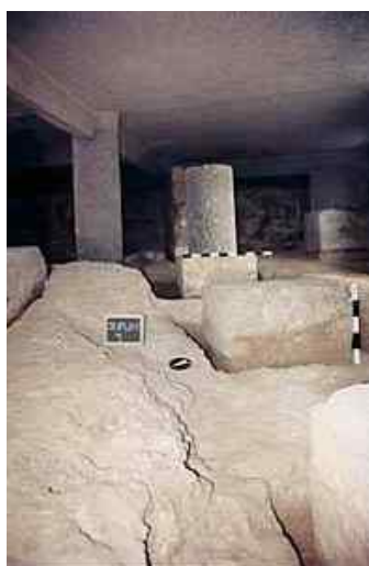
Fig. 6. Shipsheds' remains in a basement at Saggariou 1 st. at