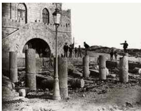
Fig. 5. Shipsheds' remains at Saggariou st. from the eastern side of Zea basin (Papachatzis 1974, 108)