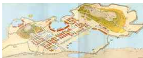
Fig. 2. Representation of the ancient city of Piraeus Representation (Papachatzis 1974, 104)