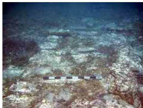
Fig. 3 View of the wall at the northern side of the the harbour