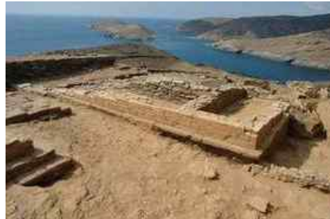
Fig. 1 The temple after the excavation season of 2006. Vriokastro islet at the far end ( http://www.ha.uth.gr/resources/downloads/kythnos2006.pdf ).