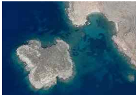
Fig. 2 General view of the Mandraki bay.