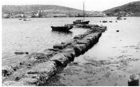
City wall remnants of the ancient city at Ambelaki [ http://www.ypai.gr/atlas/thesi.asp?idthesis=279 ]