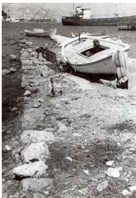
Mole remains remains on the south side of Ambelaki bay from SW (Lolos 1995, fig. 10)