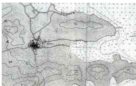
Map of Ambelaki bay, where they are the remnants of the Classical / Hellenistic harbour (Lolos 1995, fig. 4)