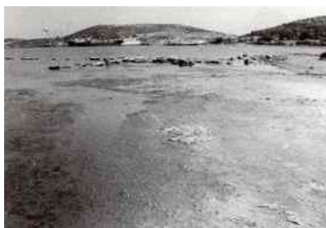
Ancient harbour-works on the west side of Ambelaki bay from NW (Lolos 1995, fig. 7)