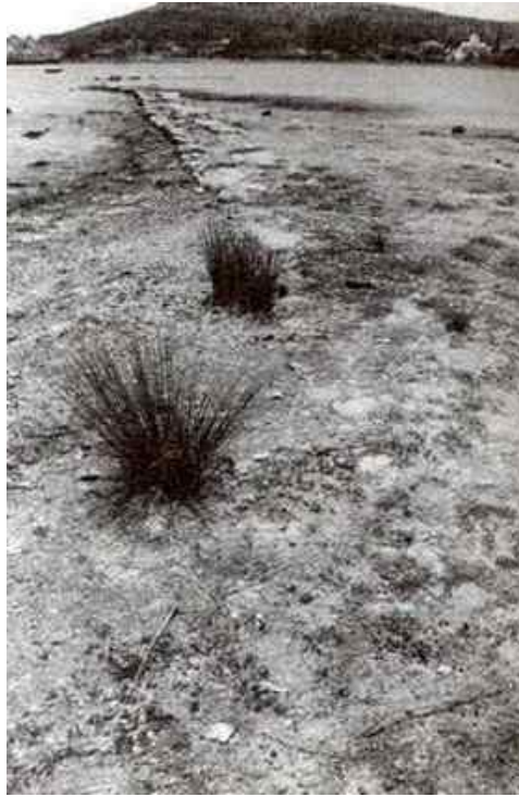
Mole remains remains on the north side of Ambelaki bay from N (Lolos 1995, fig. 11)