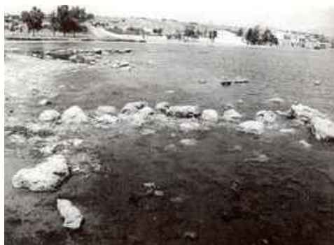
Ancient harbour-works on the west side of Ambelaki bay from SW (Lolos 1995, fig. 9)