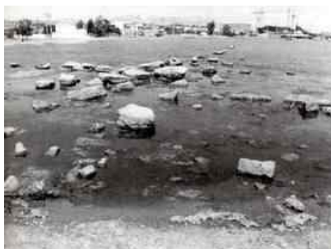
Ancient harbour-works on the west side of Ambelaki bay from W (Lolos 1995, fig. 8)