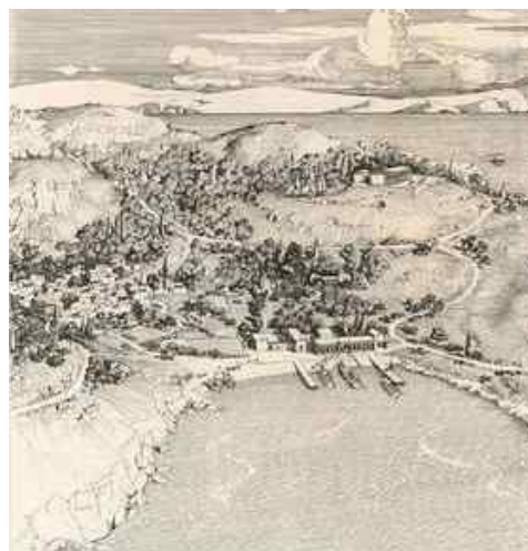
Fig. 3. Representation of harbour structures at the beach of