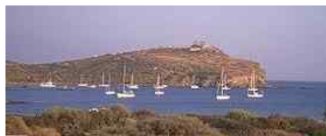
Fig. 4. View of cape Sounion with the temple of Poseidon, from west ( http://lilt.ilstu.edu/DRJCLASSICS/sites/sounion/0088.htm )