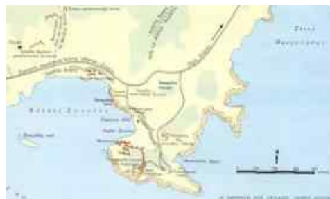
Fig. 1. Map of Cape Sounion with the ancient remains (Papahatzis, 1974, )