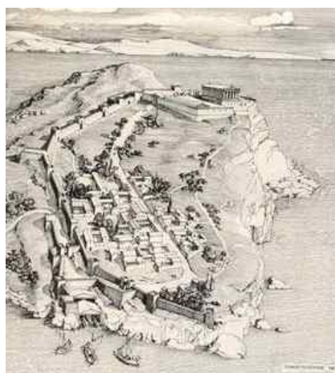
Fig. 2. Representation of the structures of the walled site of Sounion. Among them the ship-shed (Papahatzis 1974, 90)