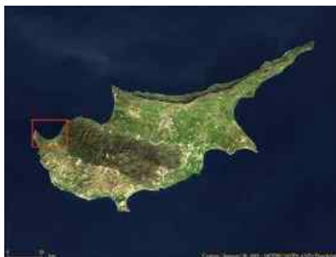
Fig. 1 General view of Cyprus. In the rectangle the area of the ancient kingdom of Marion