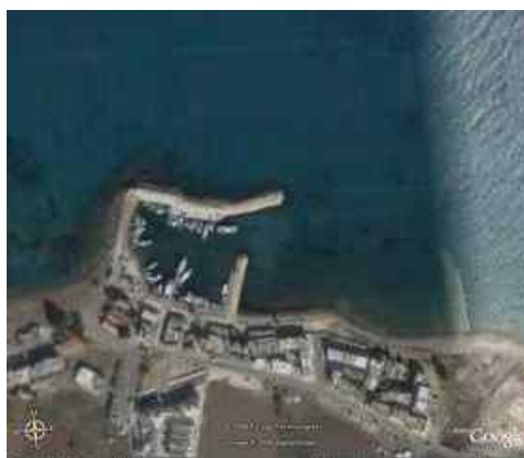
Fig. 2 View of the harbour at Latchi. Parallel to the modern western mole there are evident the remains of the ancient mole structure.