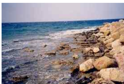
Fig. 5 View of the blocks at the western mole in 2003, before modern reinforcement covered them at all (Theodoulou 1995)