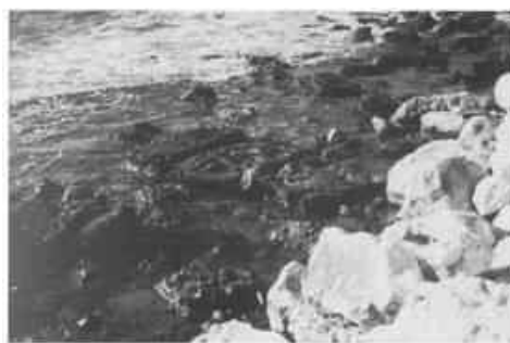
Fig. 4 View of the blocks at the western mole in 1971 (Raban1995, 164, fig. 37)