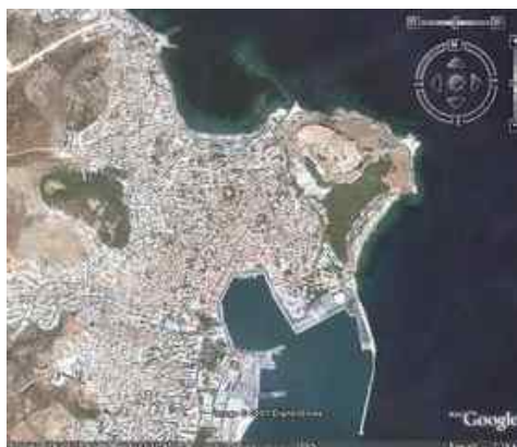
Satellite view of the harbours of Mytilini (Google Earth)