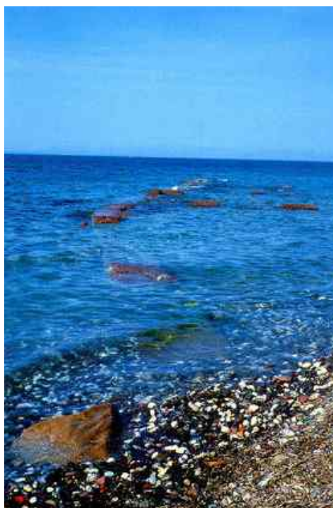
View of the remains of the northern breakwater at the area of Kalamaris (Paraskevaides 2002)