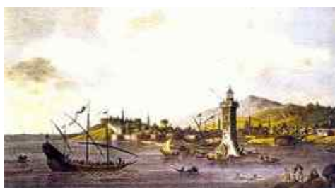
Lighthouse at the end of the eastern breakwater on a gravure of the 18th century (Paraskevaides 2002)