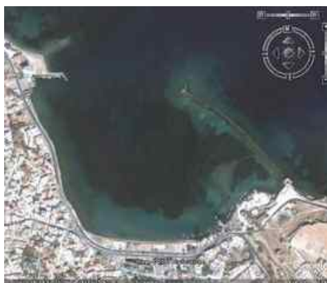
General view of the northern harbour. A third breakwater (former?) is visible at the inner side of the eastern one