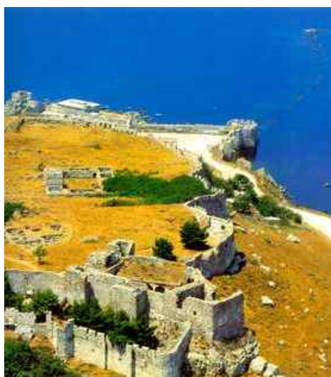
The castle of Mytilini with the eastern ancient breakwater (Paraskevaides 2002)