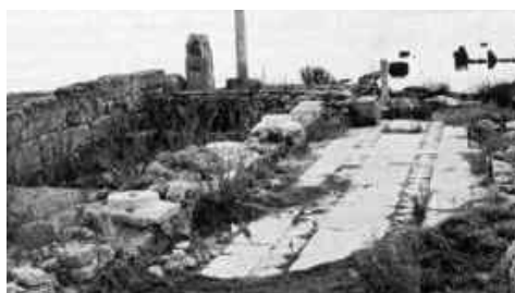
Fig. 3. View of the Early Cristian basilida at the south mole (Παναχατζής 1974, 49, εικ. 33)