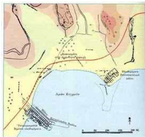
Fig. 1. Plan of the area of the harbour with the located harbour installations