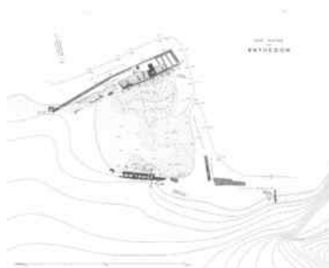
Fig. 2. Plan of the harbour structures after the investigation of 1967 (Schlager et al. 1968, plan 2)