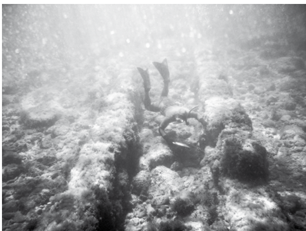
Fig 2: Submerged pier

positioned at a minimum depth of -1.5\text{m} and at a maximum depth of -3\text{m} .