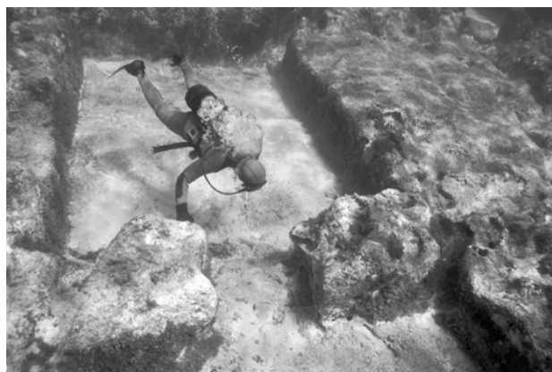
Fig 3: A tank of the vivarium

The diver will be able to visit a submerged quarry. The depth is 3\text{m} underwater.