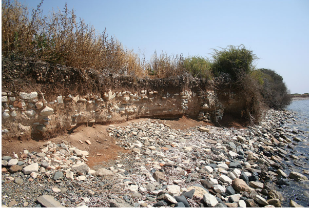
Fig. 9 View of sea scarp with eroding structures, eastern part of site at Tochni Lakkia (June 2011).

everyday life, even if such activity is not always apparent archaeologically, not least because of what (Braudel 1972:146–148) termed the ‘changing fortunes’ of maritime regions. In his words, ‘... the apparent death of a coastal region may be no more than a change in the rhythm of its life’, passing from a recorded to an unrecorded existence, vanishing whenever ‘it lapses into its obscure everyday life’ (Braudel 1972:148). In other words, interconnections along maritime routes may shrink or expand as the result of differing economic, social or political conditions that prevailed during different eras (Demesticha 2019:7).