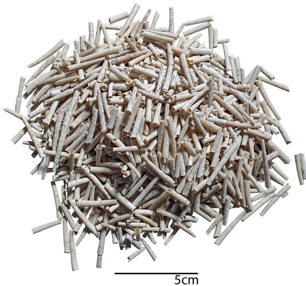
Fig. 7 Dentalia (small find no. 467) from the Middle Chalcolithic cemetery (Tomb 216) at Souskiou Laona . From Peltenburg et al. 2019:pl. 106.11; photograph by Edgar Peltenburg. Courtesy of Lindy Crewe and Diane Bolger

that interactions between them may have been conducted by ‘part-time seafarers’ on small seacraft (‘coasters’) along the littoral zone (Duncan Howitt-Marshall, pers. comm., January 2020), what Tartaron (2013:188–189) defined as ‘coastscares’. Regarding external maritime contacts, Peltenburg (2006:168–170) has allowed that the use of faience, as well as early metalworking, may have been imported technologies, even if the evidence remains equivocal. But do the ‘foreign’ artefacts from Ayious and non-native materials (chlorite, faience) from Mosphilia and Vathyrkakas actually add up to increasing communications with the surrounding world? We have to consider the possibility that Chalcolithic Cypriotes adopted an intentional strategy of maintaining a distinct, somewhat circumscribed island identity, what Peltenburg (2004:84) termed a ‘dynamic of stability’ for the preceding periods. However, by the end of the fourth and during the first half of the third millennium BC, i.e. during the Late Chalcolithic and the subsequent, early phases of the Prehistoric Bronze Age, Cypriot contacts with Anatolia, the Aegean and perhaps even the southern Levant increasingly come to the fore.