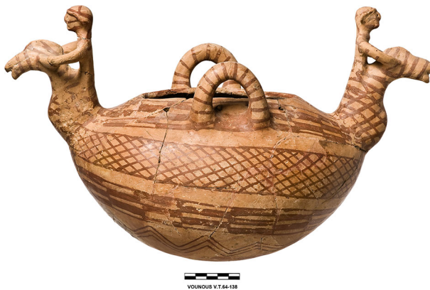
Fig. 8 ‘Boat’ model of PreBA 1 (Early Cypriot) date, from Bellapais Vounous Tomb 64.138.

Dentalium (or ‘tusk’) shells are quite common at PreBA sites, in both domestic and funerary contexts, whilst other marine molluscs—helmet shells, cockles, dog cockles—are also attested. They occur at inland sites like Marki Alonia from the Philia phase through the MC period, largely as dentalia used in necklaces (Reese and Webb, in Frankel and Webb 2006:257–261), and at MC Alambra Mouttes (triton shells, dentalia, murex) where they were used in necklaces and other ornaments (Reese, in Coleman et al. 1996:482–484). Excavations at EC and EC/MC Politiko Troullia , today located some 40 km from the south coast, produced 45 marine shells and 2 marine crabs (David Reese, pers. comm., April 2020). Early excavations at the EC site at Sotira Kaminoudhia , today located some 5 km from the coast, produced 41 marine shell fragments and 5 crab claws (Reese 2003:455); later seasons (2001–2002, 2004) turned up 89 marine shells, 6 crabs and 1 fish bone—from a barracuda (Reese, pers. comm., March 2020). Excavations through 2015 at the Middle Cypriot site of Erimi Laonin tou Porakou , located some six km from the coast, produced 26 marine shell fragments from five different species (Reese and Yamasaki 2017). None of the species recovered were suitable for producing coloured dyes, so there is no obvious link between the marine molluscs recovered and the textile workshop proposed for the site. An almost complete necklace found in the cemetery at the site (Tomb 240) was made from 15