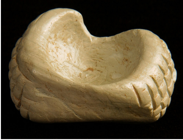
Fig. 6 Small hollow cup (< 3 cm) made of picrolite, perhaps depicting a boat. From Şevketoğlu 2018:22, Fig. 15; photograph by İsmail Gökçe. Courtesy of Müge Şevketoğlu and the Akanthou Rescue Excavation Project

105, 2006:125, 136, Fig. 24; Şevketoğlu and Hanson 2015:235–236). According to an unpublished report by David Reese (pers. comm., March 2020), excavations conducted through 2014 at Kritou Marottou Ais Giorkis —today about 25 km from the sea—produced a total of 982 marine shells, 189 freshwater shells and 9 fossils.