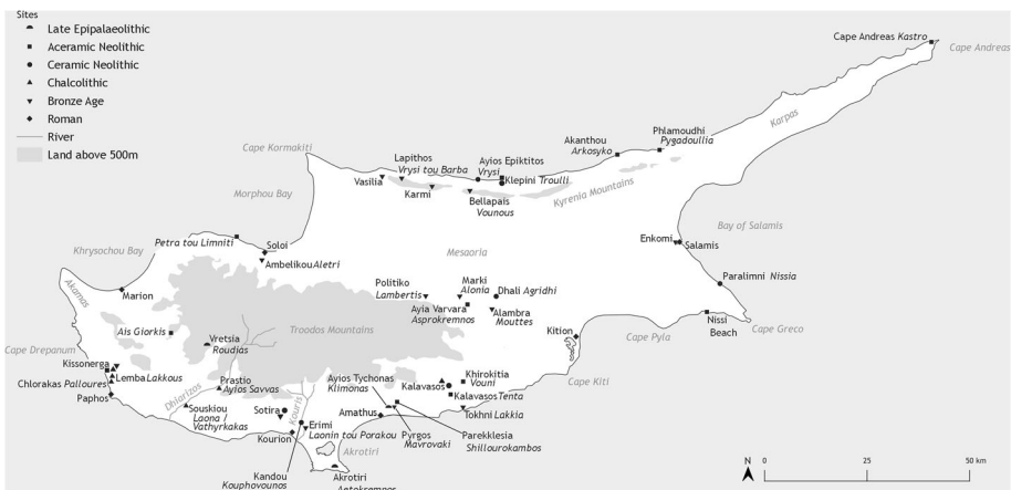
Fig. 4 Map of Cyprus showing all sites and topographic features mentioned in text. Produced by Luke Sollars

Occupation at both Klimonas and Asprokremnos signals the permanent presence of people on the island. Asprokremnos is not a typical ‘village’ site, but rather one that may have been involved in the systematic exploitation of mineral commodities (ochre and other pigments) designated at least in part for export to the Levantine mainland (McCartney and Sorrentino 2019:63). Such a scenario suggests that certain people living on Cyprus were seafarers who continued to be engaged within a mainland ‘social milieu’, what McCartney and Sorrentino (2019:75) term ‘a seascape territory including Cyprus ... in which groups uninterested in village settlement embraced seafaring’. At Klimonas , early ‘village’ life is attested by several small, round buildings and one, large ‘communal’ structure (Building