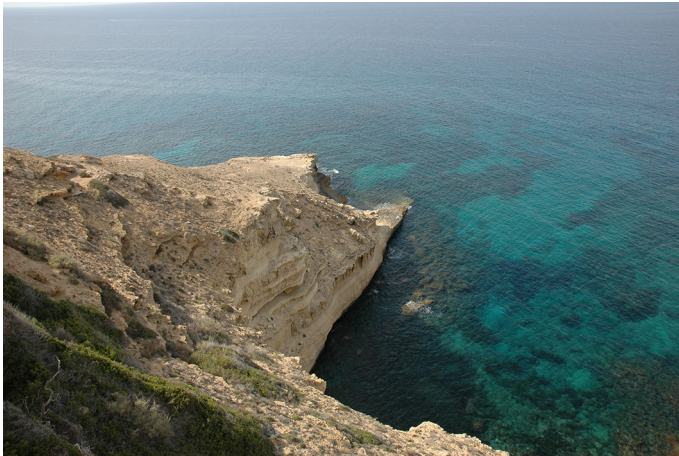
Fig. 2 View of Akrotiri Aetokremnos , today situated on a steep cliff some 40 m above the sea on the Akrotiri peninsula, south coast of Cyprus.

collection of marine shells were some 160 shell beads, with examples worked from Antalis (dentalium), Conus ventricosus (cone shell) and (the majority) Columbella rustica (dove shell) (Reese 2006:25). The chipped stone assemblage demonstrates clear parallels with blade/bladelet-orientated and microlithic technologies found in Natufian contexts on the mainland, dated ca. 13,000–10,000 Cal BC (Simmons 1999, 2013).