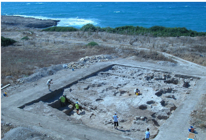
Fig. 5 Overview of excavations in progress at the EAN coastal site of Akanthou Arkosyko . From Şevketoğlu 2006:129, Fig. 1. Courtesy of Müge Şevketoğlu and the Akanthou Rescue Excavation Project

Moutsiou's study demonstrates the long-term use of obsidian on the island, a period of some 3000 years (ca. 8500–5200 Cal BC), although the actual end date of the LAN remains uncertain (Knapp 2013:187–192; Manning 2013:504–507). The most striking feature of her study, however, is the tenfold decline in obsidian use by the LAN (from about 4500 pieces in the EAN to 57 pieces in the LAN). By the following, Ceramic Neolithic period, most sites have only one or two pieces. The Anatolian origin of the obsidian found on Aceramic Neolithic Cyprus, and in particular the technology involved (primarily blades and bladelets with little evidence of core debris), suggest that obsidian was transported as a finished product in maritime exchange networks that possibly terminated at north coast sites such as Arkosyko or Phlamoudhi Pygadoullia ; Şevketoğlu and Hanson (2015:227) observed that such sites may have served as 'gateways' from which obsidian was distributed to other, contemporary sites on Cyprus (Fig. 5). Finally, as Moutsiou (2018:242) observes, long-distance and especially seaborne travel during the Aceramic Neolithic required substantial planning and was a risky, time-consuming endeavour whose benefits had to outweigh the costs. In her view, the presence of obsidian