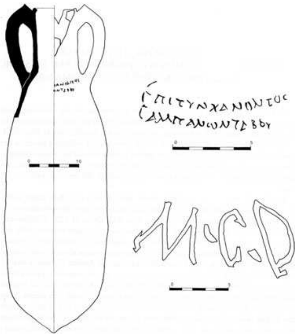
Figure 2. S. Maria Capua Vetere, Cretan amphora. (after De Caro 1992–3)

painted inscription documenting that it was a part of the produce of this territory: '(οινου) επιτυγχοντος / (των) Καμπαίων, (τα κεραμια) βοῦ' (belonging to the wine of the Campanians, 472 amphoras) (De Caro, 1993: 307 ff.; for commerce between Crete and Campania see Tchernia, 2008: 61ff.) (Fig. 2).