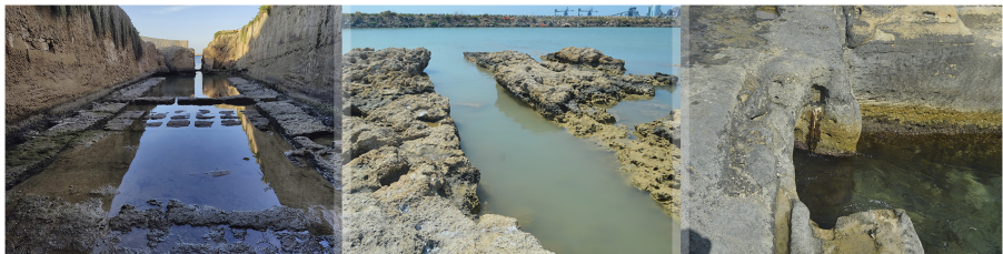
Plate 1. Constructional features of the Roman Fish Tanks: Crepido (Baños de la Reina, Xàbia, Spain), Channel System (La Mattonara, Civitavecchia, Italy), and Cataracta (La Albufereta, Alicante, Spain)