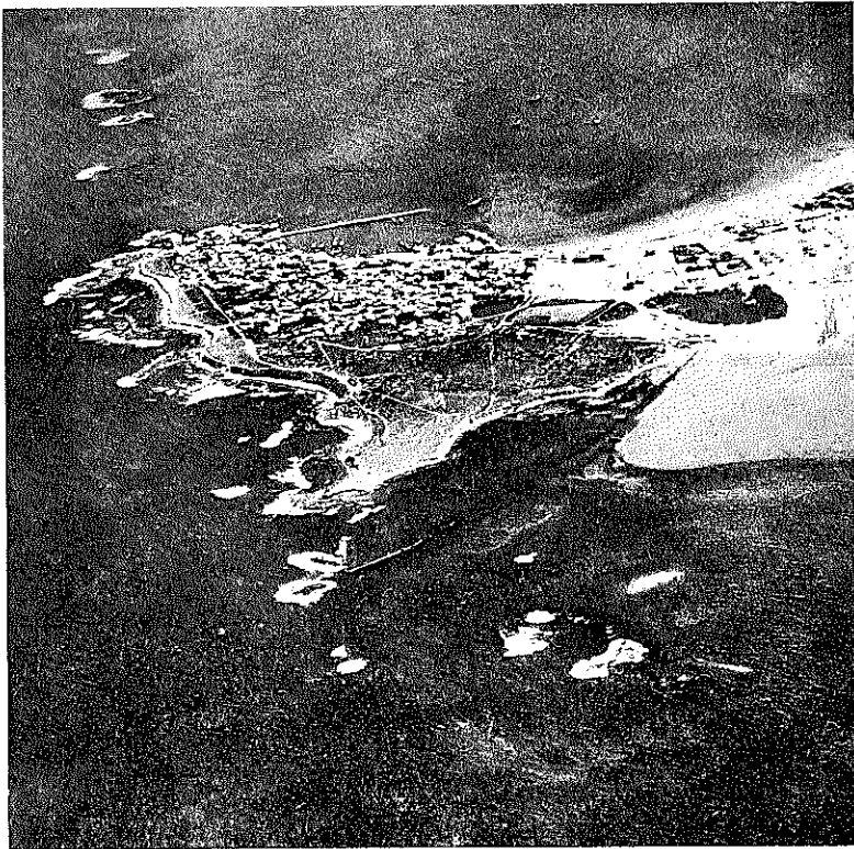
Aerial view of Tyre (1935) From A. Poidebard, Un grand port disparu: Tyr , Paris 1939